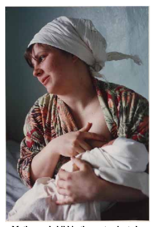
Mother and child in the contaminated area.

As part of the 20-year campaign we organized and held a photo exhibition in Belarus in 2006. Chernobyl is becoming a mere disastrous past even in Belarus as well as in Japan. Or top government officials expect that the Chernobyl disaster should be over completely. How far can people in Belarus know about the accident when they are not given enough