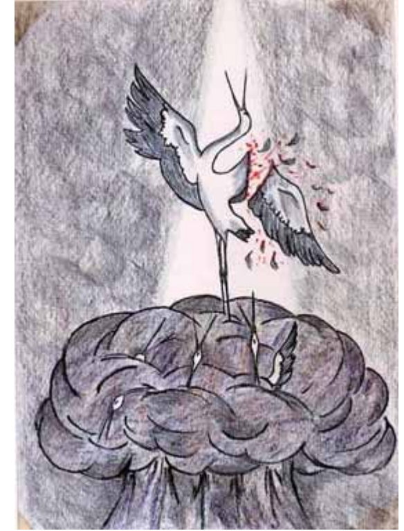
Hurt by the atom from Chernobyl. By Orga Sokolovskaya, 14yr.

These photos and pictures have been exhibited at various places such as CCFJ organized charity concert halls, citizen's organizations, city halls, schools, kindergartens, churches and temples.