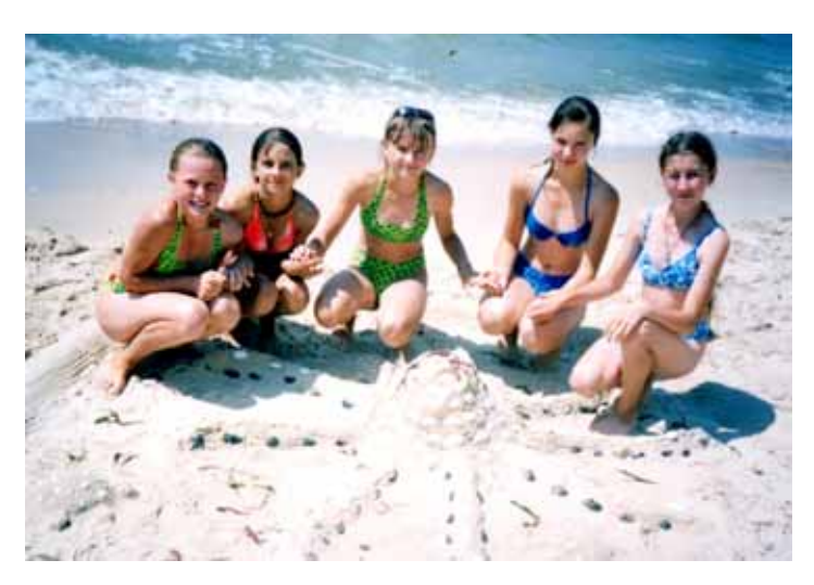
Sanatorium "South" in Ukraine

This system of scholarship is addressed to the children having had thyroid operations. We send fifty dollars per month to each student, the same amount as foster children aid, to support until their graduation from colleges. Presently fifty students are receiving the scholarship and eighty students in total have been granted with this scholarship.