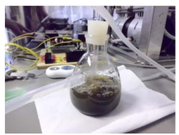
Figure 2. Bubbling ozone gas through the sludge.

in Saitama Prefecture. It had a <sup>137</sup>Cs concentration of 4.2 kBq kg<sup>-1</sup>-dry. The elemental composition of the sludge is listed in Table 1.