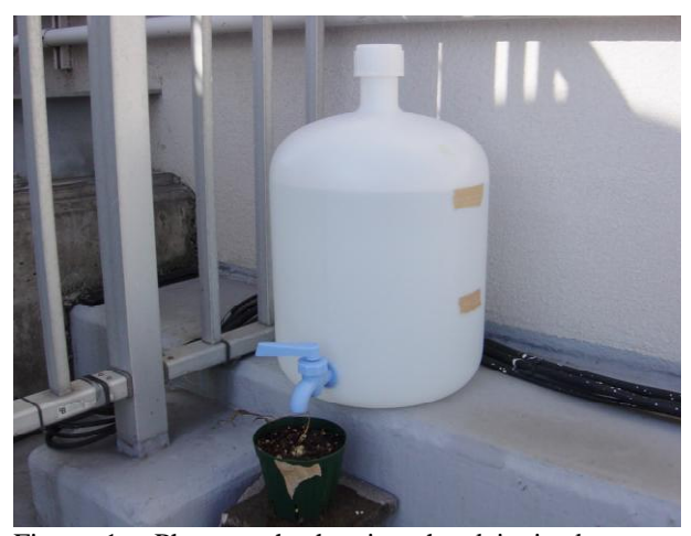
Figure 1. Photograph showing the deionized water supply setup.